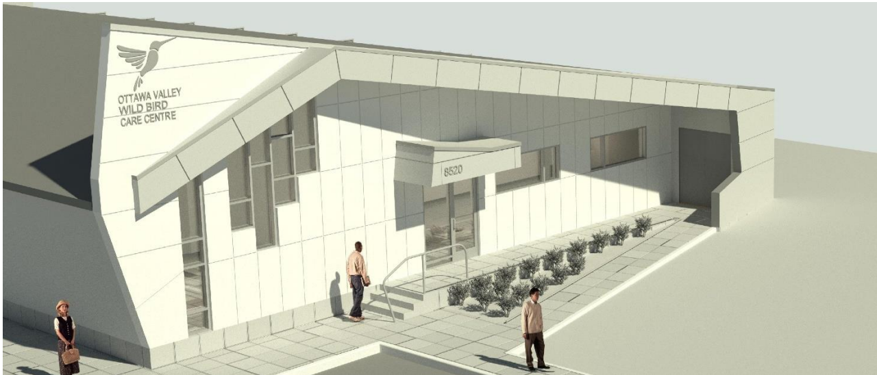
Rendering of the Building

The need for the Centre's services is expected to increase as the surrounding urban areas grow. Faced with the challenges of an aging, overcrowded building, with no option to expand, renovate or add outdoor aviaries, the Board of Directors made the decision to purchase a property on which to build a new, permanent avian advanced care facility.