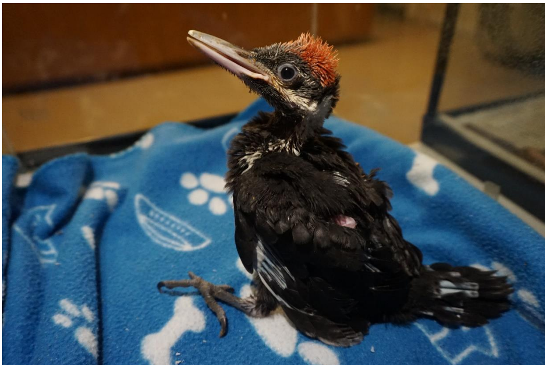
Baby Pileated Woodpecker

The well has been drilled on the property and the water test results were reported to be very good. Construction is expected to begin when the final permits have been issued and sufficient funding is in place. At the moment, the estimated timeline for completing is some time in the fall/winter of 2021.